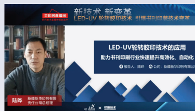
“应用大咖秀”系列直播 "Application-Savvy Show" live broadcast series