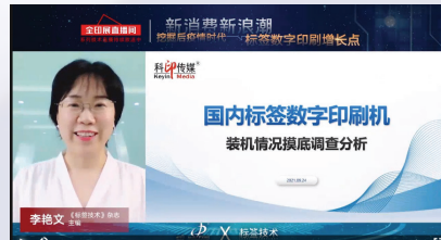
“市场洞察”系列直播 "Market Insights" live broadcast series