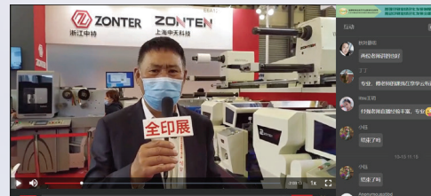
“大咖探展”展期直播 "Exhibition from Savvy's View" live broadcast