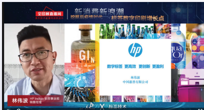
“技术大咖说”系列直播 "Tech-Savvy Talk" live broadcast series